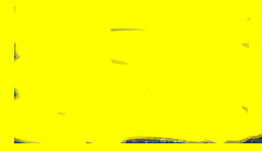
Jun 16-8:23 AM